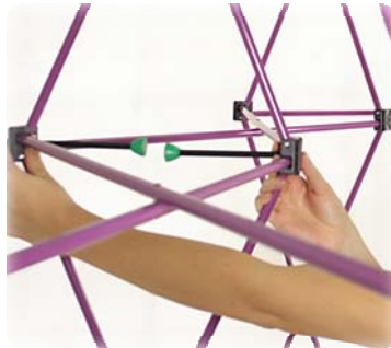
USA Made (Ours)